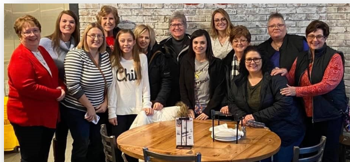
Ladies from First Baptist Church, Belle and First Baptist Church, Owensville recently helped pack shoeboxes at the Operation Christmas Child Processing Center in Chicago.